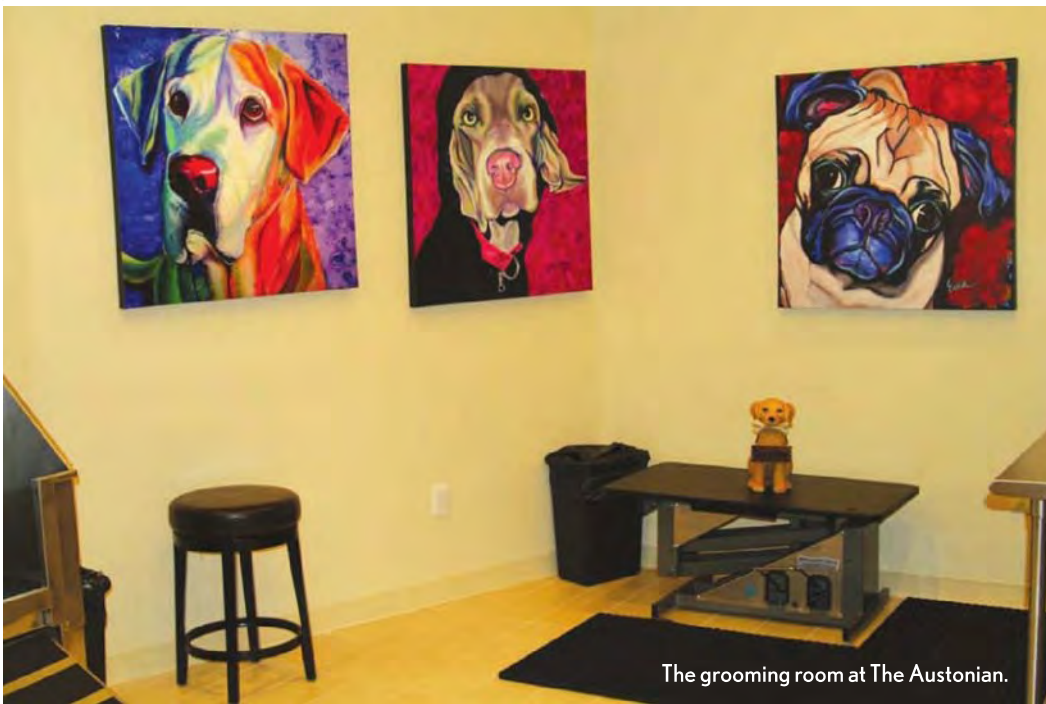
The grooming room at The Austonian.